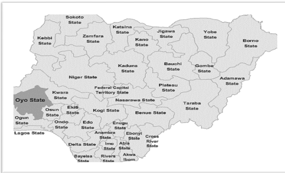
Fig. 1: Map of Nigeria with Oyo State highlighted in gray.

The study was conducted in Oyo State Nigeria. Oyo State is situated in the South-Western part of Nigeria. It is located between latitudes 7° 3' and 9° 12' North of the equator and longitudes 2°47' and 4° 23'